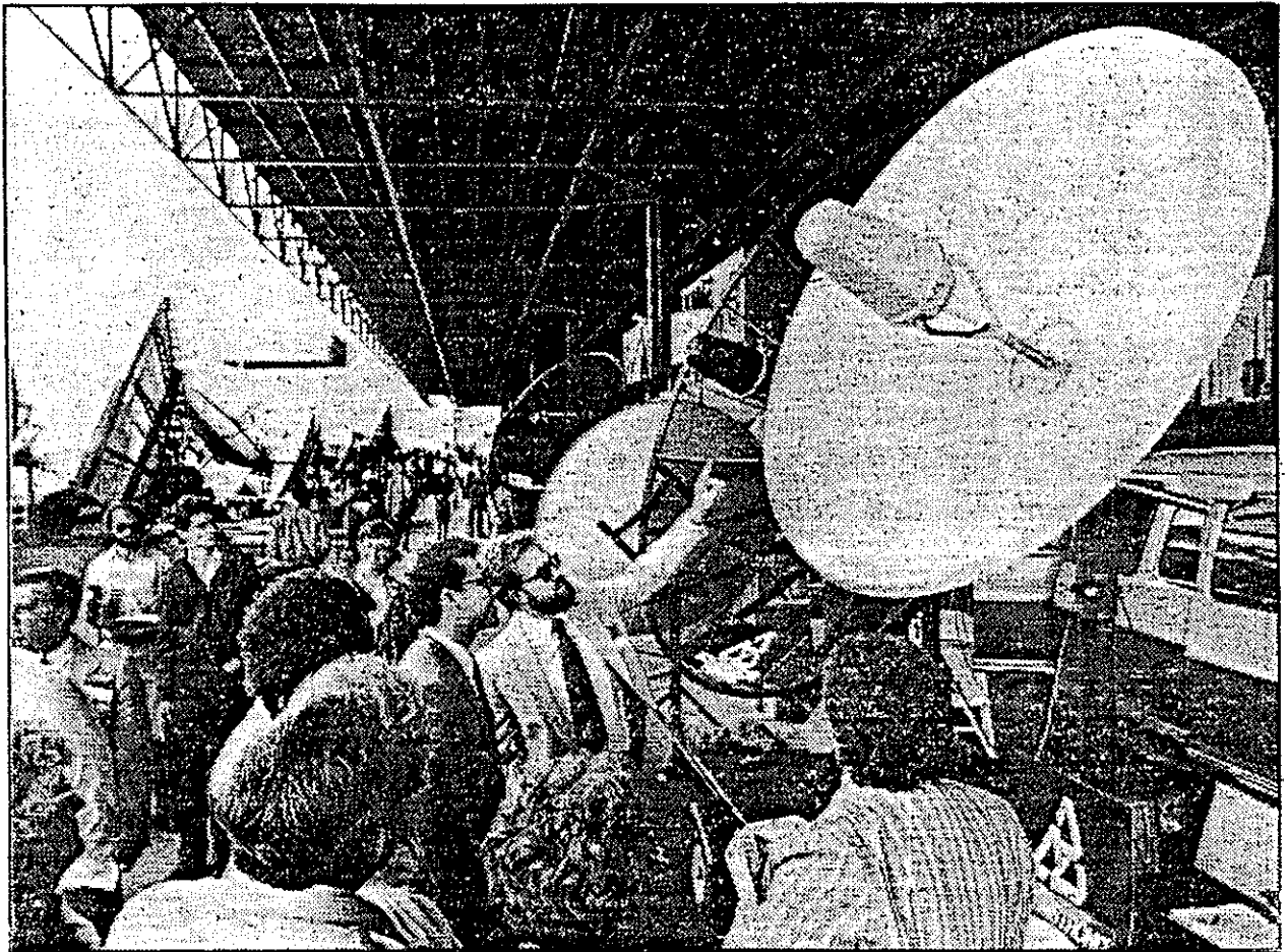
Satellite earth stations on display at Consumer Electronics Show last week in Chicago.