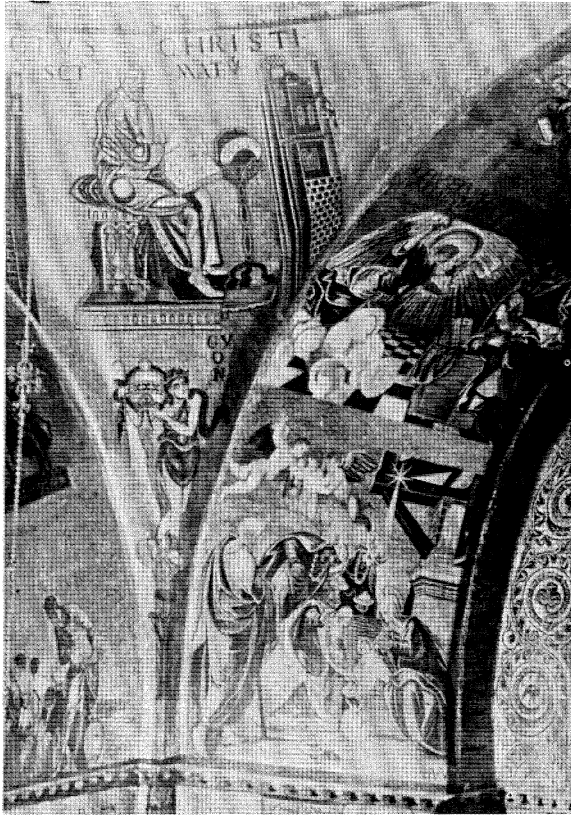
FIGURE 1. One of the four spandrels of St Mark's; seated evangelist above, personification of river below.

The design is so elaborate, harmonious and purposeful that we are tempted to view it as the starting point of any analysis, as the cause in some sense of the surrounding architecture. But this would invert the proper path of analysis. The